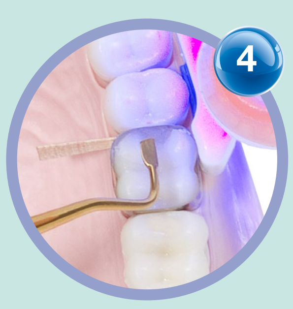
Perform restoration using normal clinical procedure.