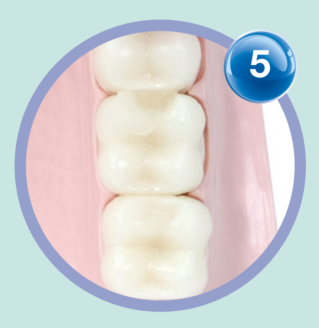
To remove the band, first loosen it by turning the handle 2-3 turns anti-clockwise.